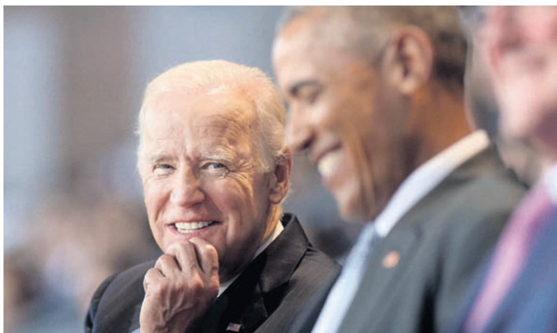
In this Jan. 4, 2017 file photo, Vice President Joe Biden, left, watches President Barack Obama, center, at Conmy Hall, Joint Base Myer-Henderson Hall, Va.

The Vermont senator ended his campaign last week and threw his support behind Biden on Monday.